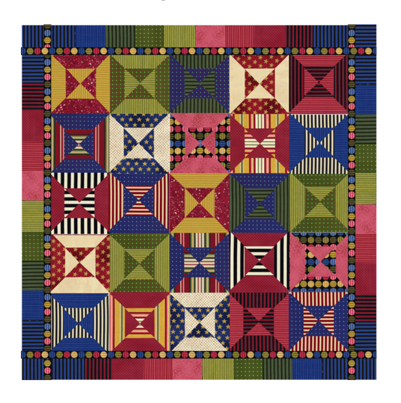
My Big Top Circus Yikes! Sewn with Lake House fabrics

The Double Hourglass block does double-duty with fantastic striped fabric. This is also fun using any florals, geometrics and a wide host of colors. The secret is in the strip size and a ruler! Bringing precut strips to class, ready for sewing, will ensure most blocks for a lap-sized quilt be sewn in just a few hours. We use LONG quarters of fabric (not fat quarter friendly).